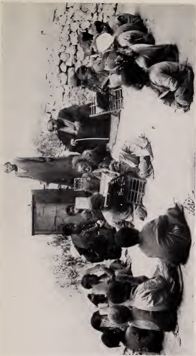
Arab children at school in Egypt